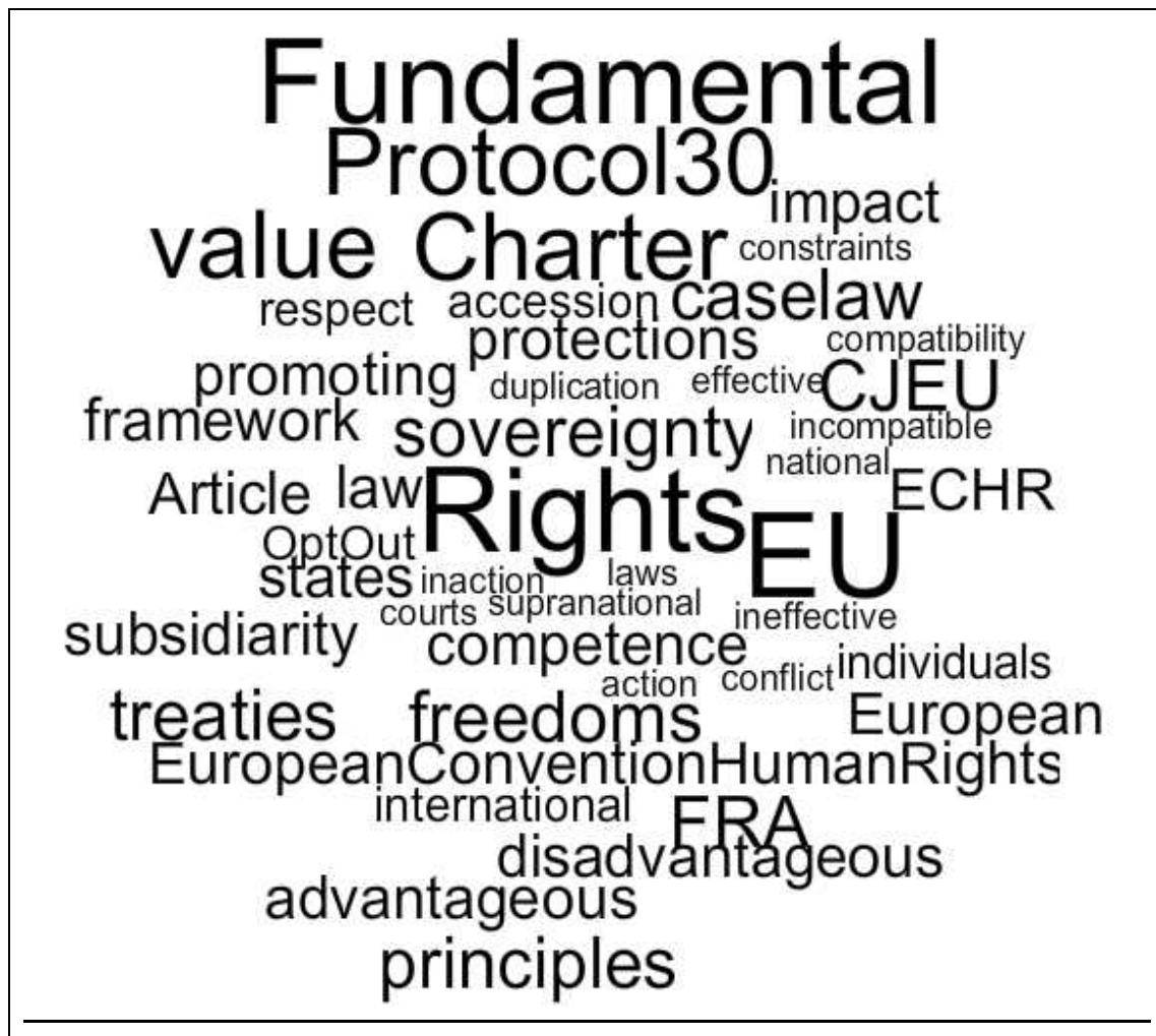
A word cloud for fundamental rights