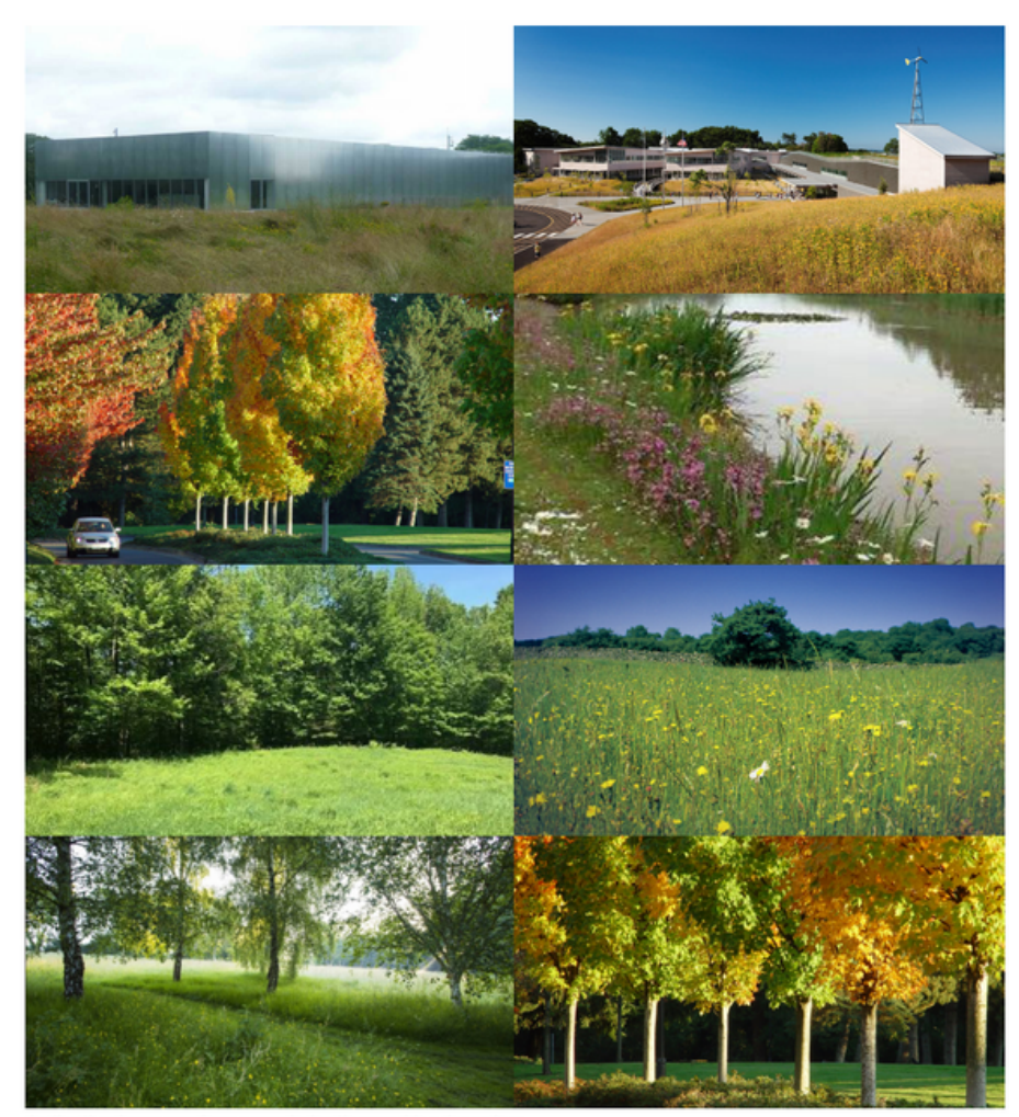
Indicative images of proposed planting and landscaping

We're still working on our plans but we'll work very hard to build a new prison that fits in with the local rural area and the wider landscape.