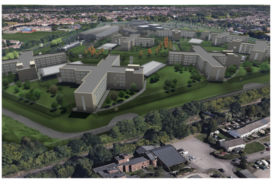
Our new Glen Parva prison in Leicestershire, currently under construction

We're building our next new prison next to Full Sutton prison in East Yorkshire. This new prison will also include our new designs. We have outline planning permission already and hope to start building soon.