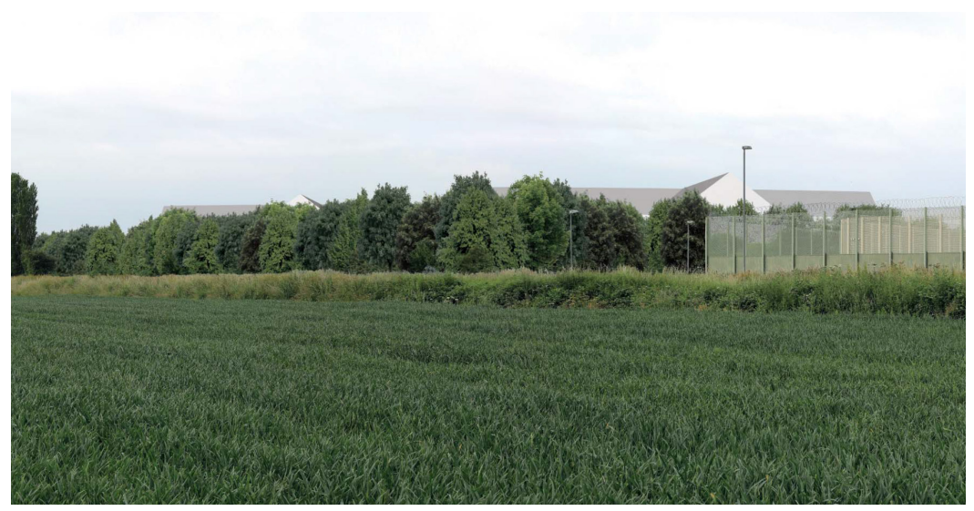
View looking south-west from public footpath, close to eastern boundary of HMP Gartree*