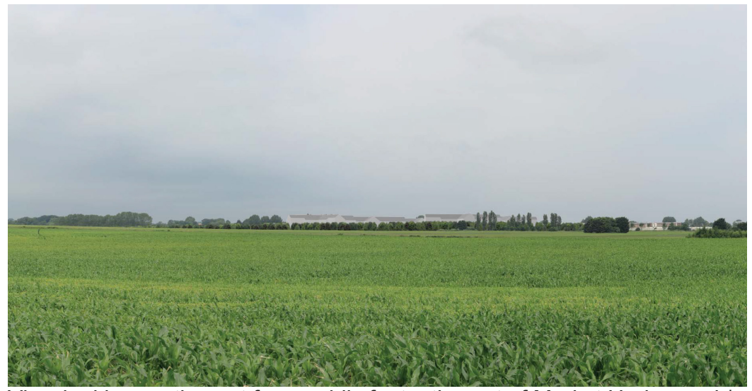
View looking north-west from public footpath west of Market Harborough*